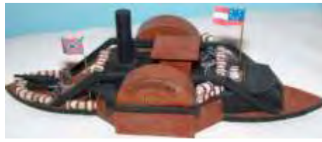
CSS Orleans Wooden